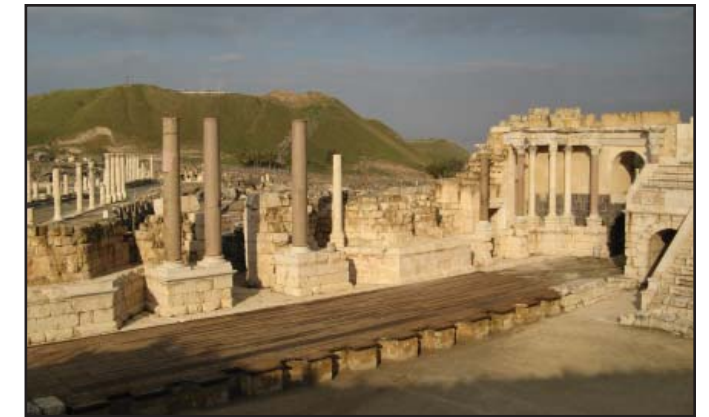
View of Bet She'an from the amphitheatre

Transfer from the hotel in Jerusalem to the airport for departure. Coach transfer back to Richmond. B*, D*